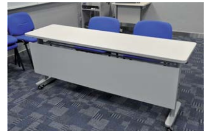
Standard Displaying Booth

Easy Roll Banner (800mm x 2000mm): $300 (PDF format file to be provided by exhibitors for output)